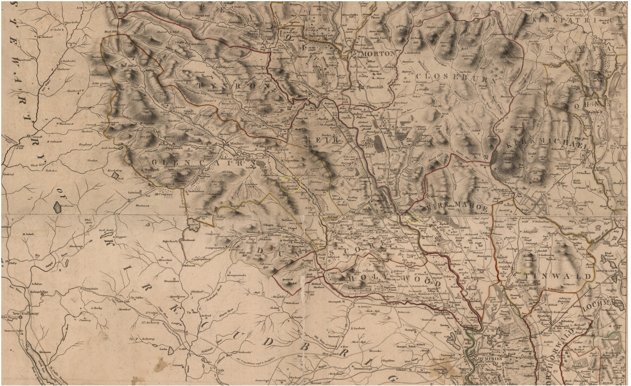
Figure 1. A detail from William Crawford's Map of Dumfriesshire (1804) showing Glencairn and neighbouring parishes. Forrest Rig, where John Waugh was born in 1789, and the farms of Stewarton have been circled.